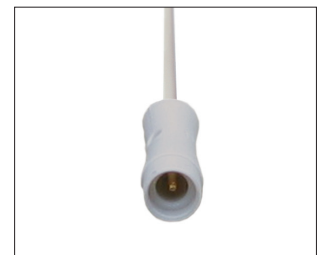
SC = 0.7 mm connector