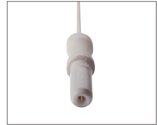
K = 1,5 mm connector