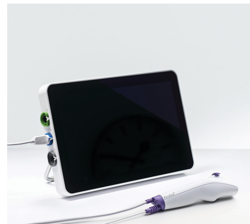
Ambu® aScope™ 4 RhinoLaryngo Slim and Ambu® aView™ 2 Advance

** aScope 4 RhinoLaryngo Slim is not available for sale in all countries. Please contact your local Ambu sales representative.