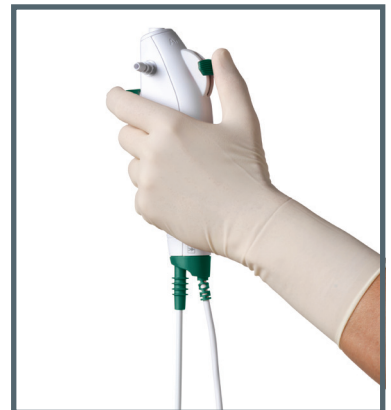
The ergonomic and lightweight handle is designed to give you a firm and comfortable grip