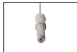
K = 1.5 mm connector