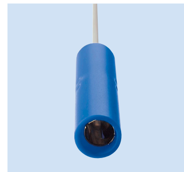
A = 4 mm connector