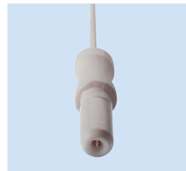
K = 1.5 mm connector